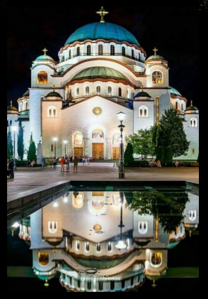
Hram Sveti Sava